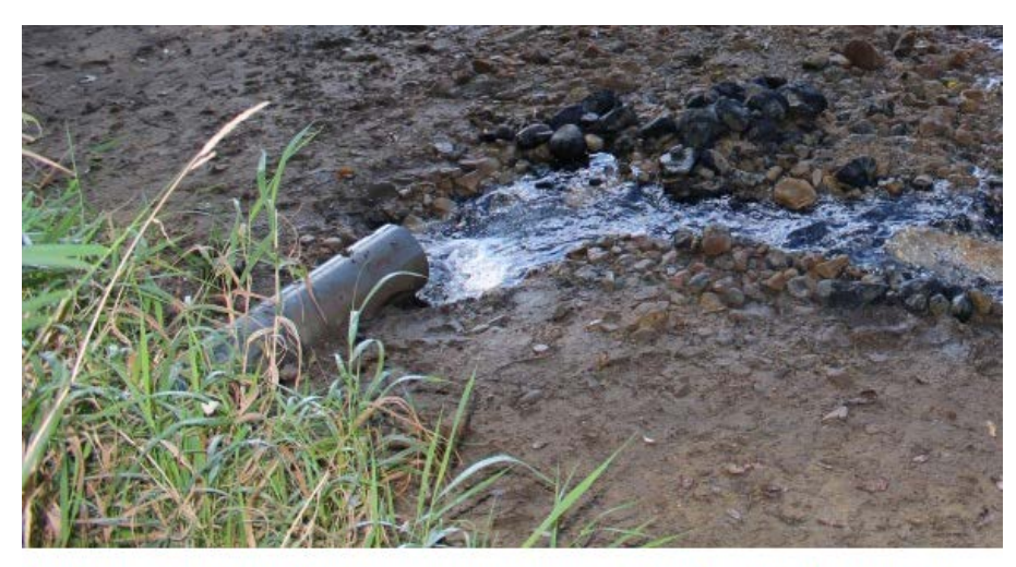
January 9, 2015: A new study on the occurrence of arsenic in groundwater and the exposure of local residents in the Mekong Delta of Vietnam was published in Science of Total Environment. The study shows high level of arsenic (up to 1,000 ppb) in groundwater adjacent to the Mekong River. High arsenic was found particularly in reduced and low-saline groundwater. Arsenic content in nails collected from local residents was significantly correlated to As in drinking water (R=0.56, p<0.001). Survey data show that the ratio of arsenic in nail to arsenic in water varied among residents, reflecting differential arsenic bioaccumulation in specific exposed sub-populations. The paper is posted here Arsenic exposure in Mekong Delta. collected in 1999 by

In the beginning of the 80s. the United Nations through UNESCO remarked that the population lived in this region has affected been cholera, diarrhea, or dysentery etc...due to untreated surface river water. In order to curb these above diseases. UNESCO advocates helping people to dig wells to get cleaner water and avoid bacterial disease. So far, there are over 357,720 (data